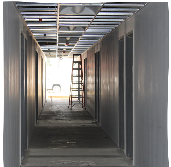
Residence Hall B renovation.