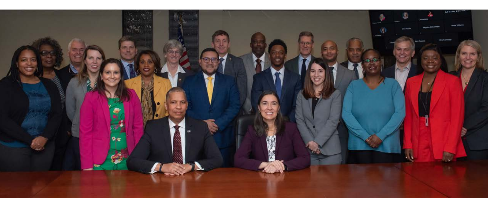
North Carolina Task Force for Racial Equity in Criminal Justice 2023

The members and staff of TREC would like to take a moment to express our gratitude to those who helped with the implementation efforts in 2023. In particular, we would like to acknowledge the Wilson Center for Science and Justice at Duke Law, Conservatives for Criminal Justice Reform, the United States Attorney's Office for the Middle District of North Carolina, and North Carolina Central University.