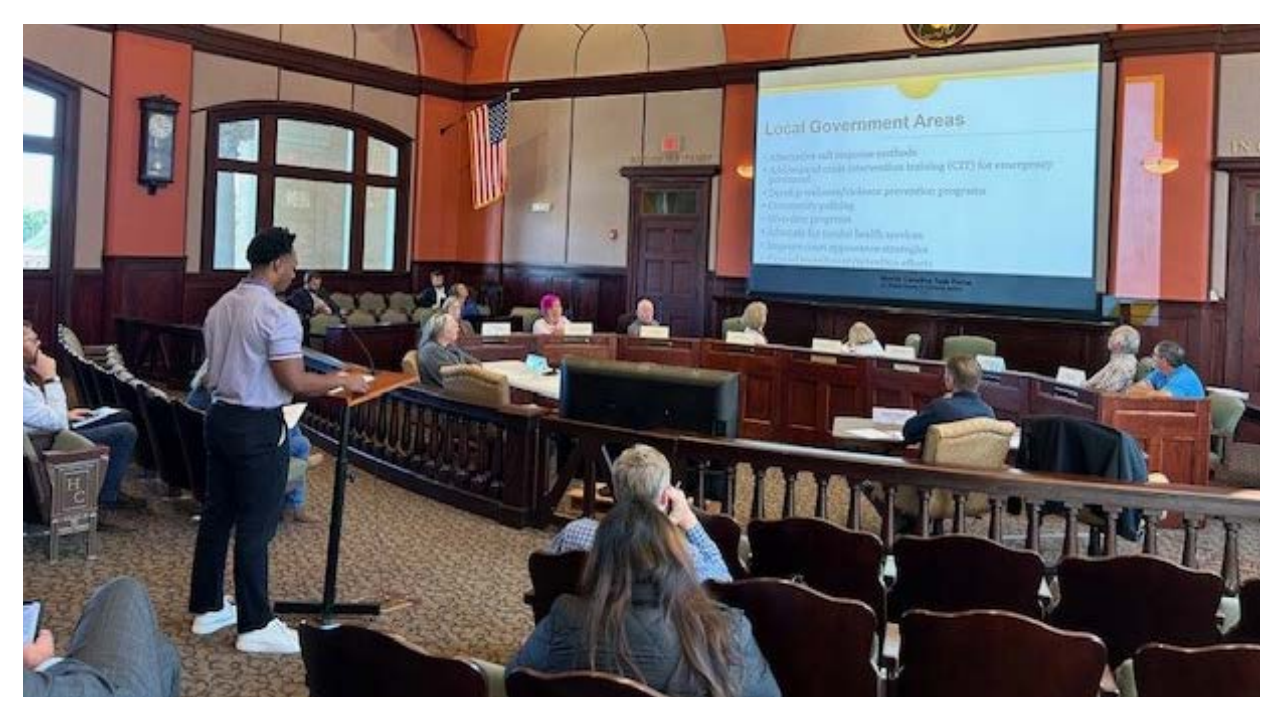
Presentation to Henderson County elected officials

This project also continued its regular engagement with the North Carolina League of Municipalities and the North Carolina Association of County Commissioners.